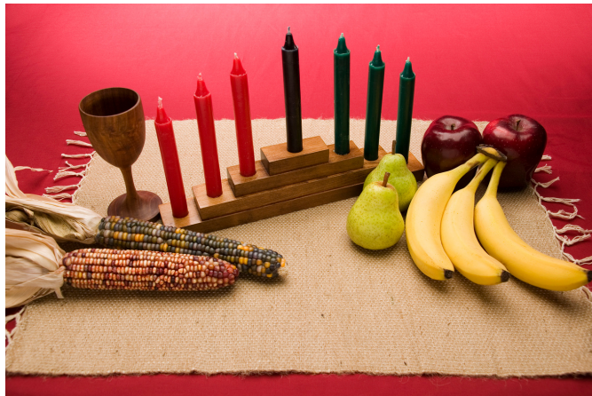
A coloring reference guide for you. Black = African people Red + Struggle Green + Hope

Welcome + Bless Your 2022 Faith Expansion